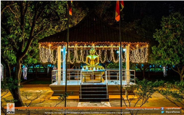
Vesak Celebration | University of Sri Jayawardenepura 2015