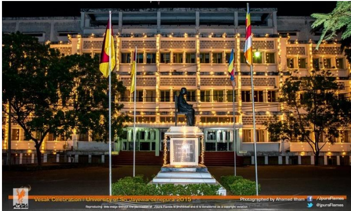
Vesak Celebration | University of Sri Jayawardenepura 2015

Reproducing this image without the permission of /apureFlames is prohibited and it is considered as a copyright violation.