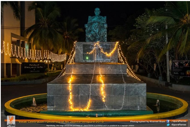
Vesak Celebration | University of Sri Jayawardenepura 2015

Reproducing this image without the permission of /apureFlames is prohibited and it is considered as a copyright violation.